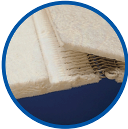
100% heavyweight fiber construction