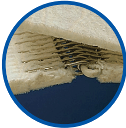
Mechanically and chemically interlocked fiber and base