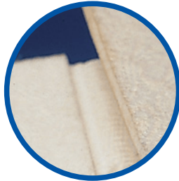
Heatset for stability